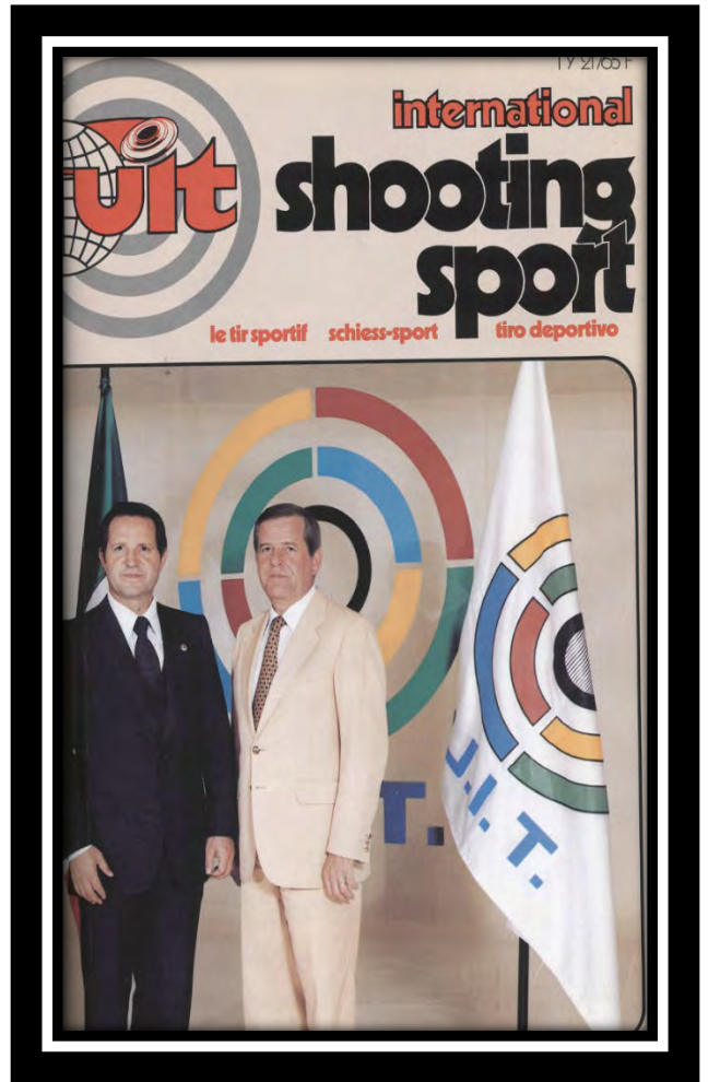
En 1980 asumiendo la presidencia de la UIT.