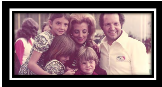
Siempre fue hombre de familia.